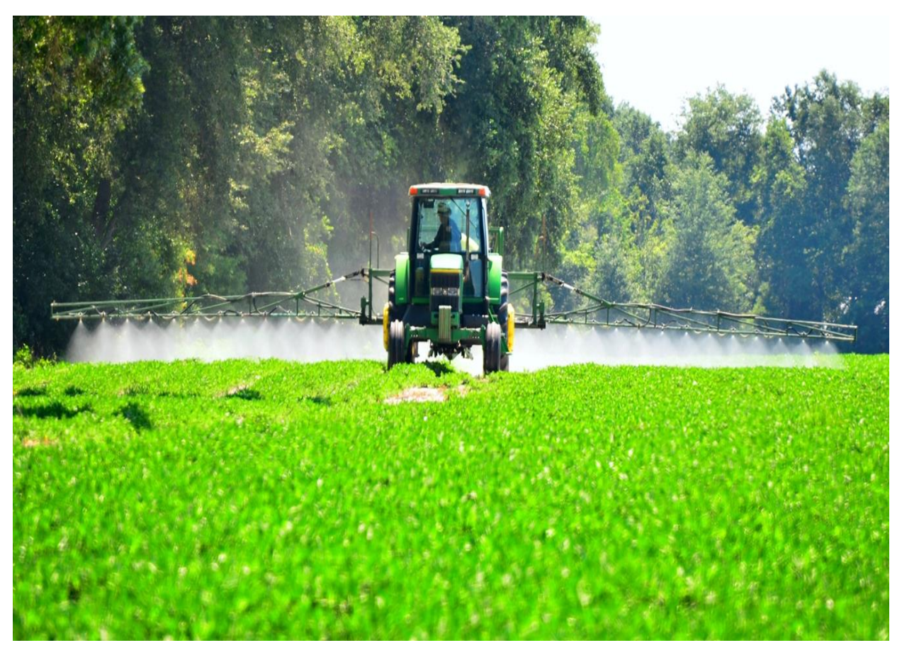
Spraying Agrinos HYT® Product on Peanuts Florida